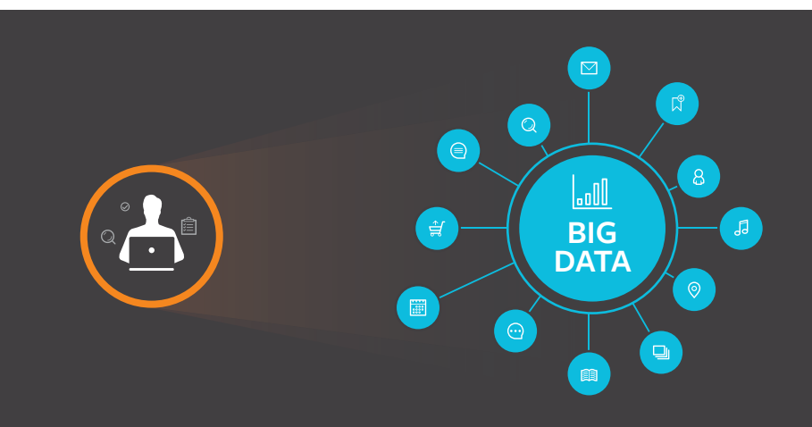
Nith the rise of big data and analytics, more organizations are performing analytics on large data sets.

With the rise of big data and analytics, more organizations are performing analytics on large data sets. IBM has addressed this need with the IBM DB2 Analytics Accelerator for z/OS, or IDAA . IDAA is an appliance that integrates with your IBM<sup>®</sup> z Systems<sup>™</sup> mainframe and DB2 for z/OS. It provides high-speed analytical processing, at times delivering orders of magnitude performance improvement. When installed, the DB2 Optimizer becomes aware of the IDAA and can build access plans to shuttle appropriate workload to IDAA. That means you do not have to change your programs to take advantage of the power of IDAA.